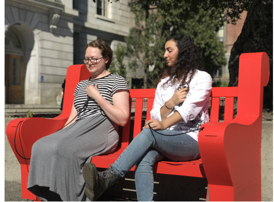
Figure 1: The Heart Sounds Bench amplifies the heart sounds of bench-sitters, inviting a moment of calm yet vibrant life-affirmation.