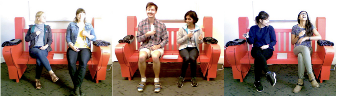
Figure 3: Participants often sat silently together listening to their heart sounds, or reflected on the experience together.

He described feeling present in the moment with his own heart beating in connection with the world. This sense of presence and connection suggests an affective experience that could be explored in designing for the smart city.